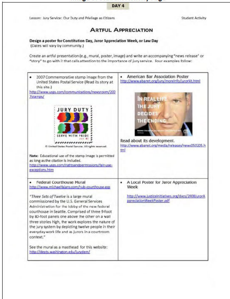
Image of Student Activity Page