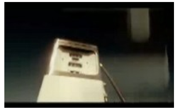
Narrator : Who can you thank for rising prices at the pump?