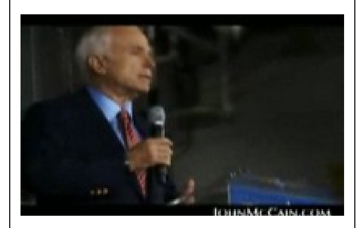
Narrator : One man knows we must now drill more in America and rescue our family budgets.