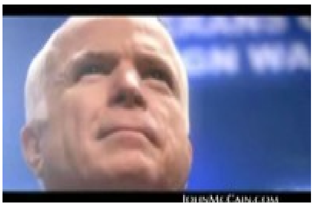
Narrator : Don't hope for more energy, vote for it. McCain.