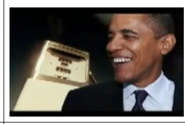
Chant: Obama! Obama!